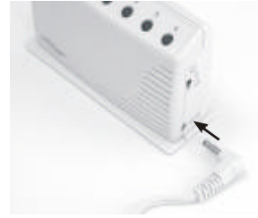
Plug in the adapter to the receiver

Activate each Household Alert® sensor, this will program the sensor to the receiver.